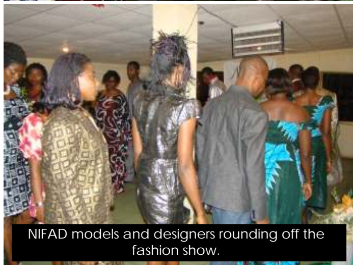
NIFAD models and designers rounding off the fashion show.