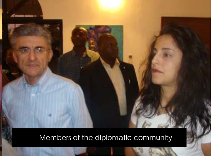
Members of the diplomatic community