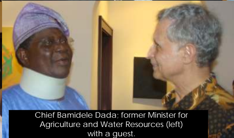
Chief Bamidele Dada; former Minister for Agriculture and Water Resources (left) with a guest.