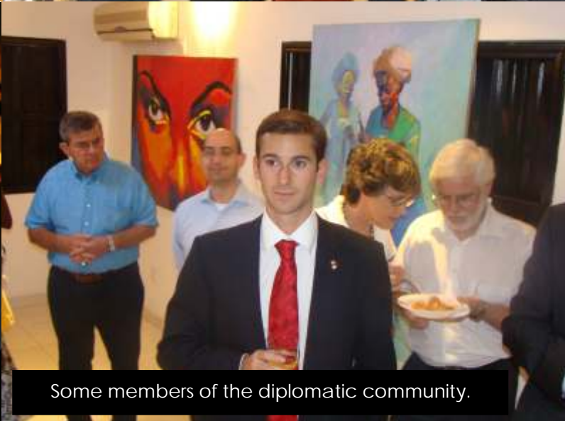
Some members of the diplomatic community.