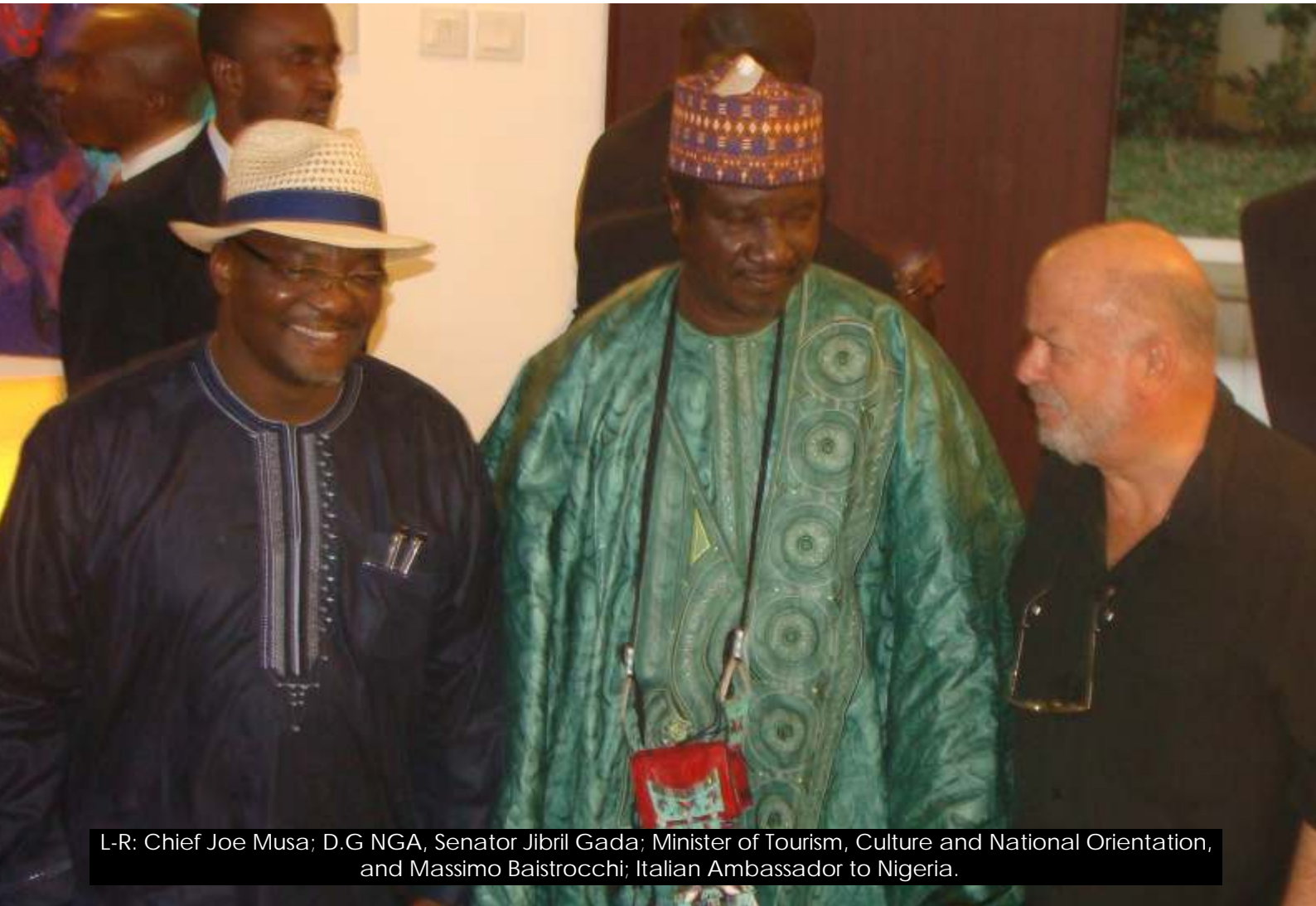
L-R: Chief Joe Musa; D.G NGA, Senator Jibril Gada; Minister of Tourism, Culture and National Orientation, and Massimo Baistrocchi; Italian Ambassador to Nigeria.